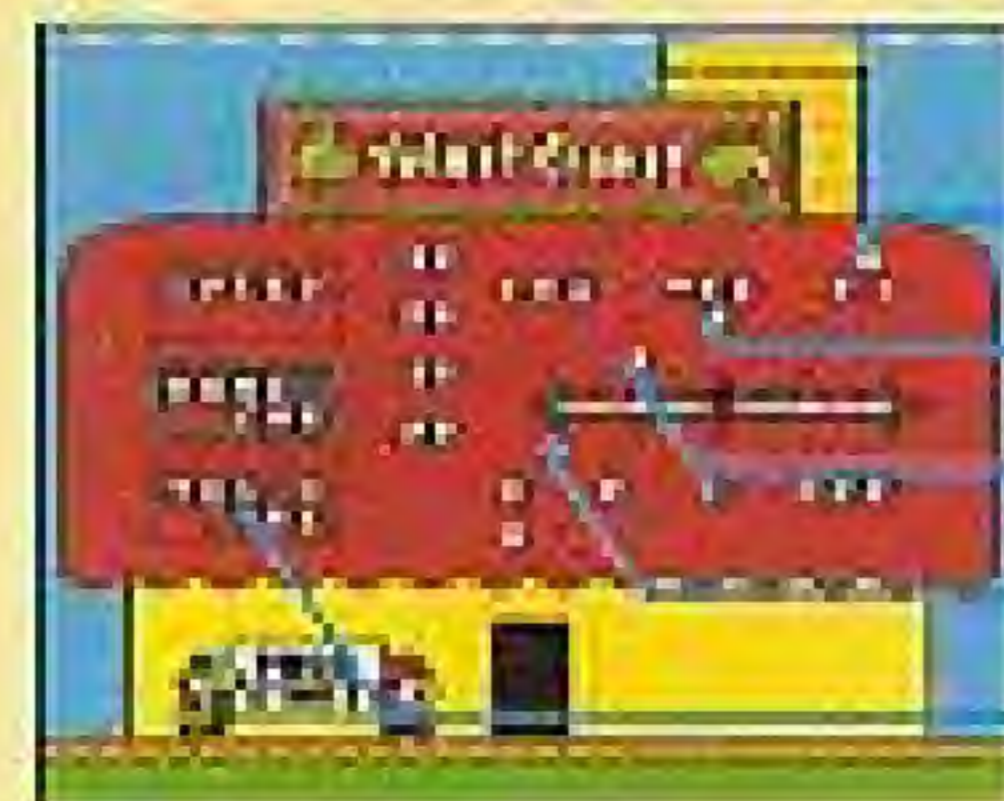
Menu Screen for VS. Game Player [1] Time Speed Player [2] Time Speed Player [1] Handicap Player [2] Handicap Music Type

Use this to select the background music. Select "OFF" to stop the music.